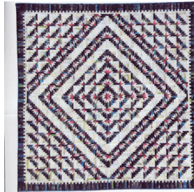
"Timberline Log Cabin" Quilters Guild of Greater Kansas City 2008-09 Opportunity Quilt